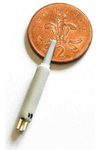
The illustration shows the main part of the magnetometer. The field sensing element is of sub-millimetre dimensions and is placed at the tip of the sensor.

This enables it to use an excitation frequency of several tens of MHz resulting in a sensor with a bandwidth of dc to 5MHz combined with low noise and wide dynamic range.